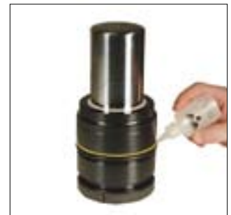
6. Extra oil should be applied to the housing o-ring, cushion seal and the inside of the housing.

Return to DADCO's Large Gas Spring Maintenance Bulletin Step VI., Step 3.