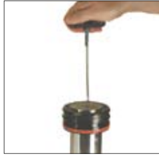
2. Unscrew the four collar retainer screws connecting the rod retainers to the cushion collar, set screws aside for reassembly.