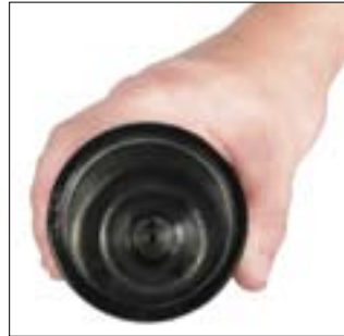
2. Inspect the tube assembly for any damage, especially around the mouth. Polish out any scratches at the mouth to avoid damaging seals during the reassembly process. If damage to the tube is severe it must be replaced. Wash, clean and dry the inside of the tube assembly.