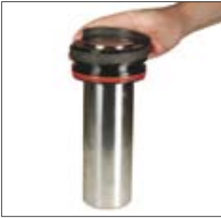
1. Remove the wear ring.