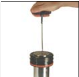
4. Fasten the cushion collar onto the rod retainer using the four collar retainer screws, torque value = 42 lb-in (5Nm).