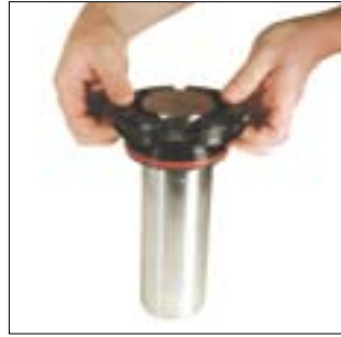
3. Remove the two retainer halves and set aside for reassembly.