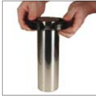
1. Replace the retainer halves and add the wear ring.