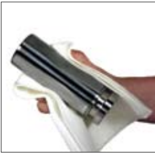
1. Lightly polish the rod surface with an emery cloth (600 grit). Inspect the finish of the rod for any scratches or gouges. If the rod is damaged it must be replaced. The rod safety ring may remain in place.