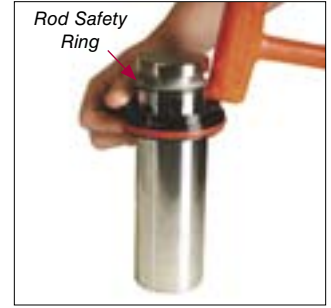
4. Tap the cushion collar down to slide off the rod end and discard.