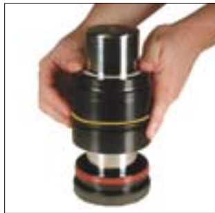
5. Position the cartridge assembly over the rod, making sure the wiper end marked "TOP" is facing up. Slide the cartridge down the rod to the cushion collar. Be careful not to force the cartridge at an angle as the seal could become damaged.