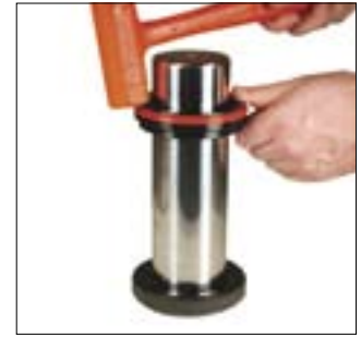
2. Using some of the assembly oil lubricate the rod and slowly tap the new cushion collar onto the top of the rod. Using a mallet or an Arbor Press, seat the collar against the rod retainers.