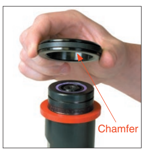
5B. Install the Piston onto the Guide Rod with Piston chamfer facing toward the cartridge.