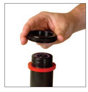
2. Slide the Piston off the Guide Rod. NOTE: If Piston shows signs of damage it must be replaced.