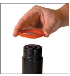
5A. Install the Cushion onto the Guide Rod.