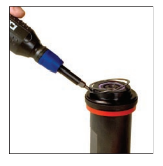
6. Install the new Retaining Ring by pressing into place with the Port Servicing Tool's small flat bit. The Retaining Ring must be completely seated in the square groove. Return to DADCO's SLN.300 Maintenance Bulletin VIII. Seal Kit Replacement and Reassembly, step 7.