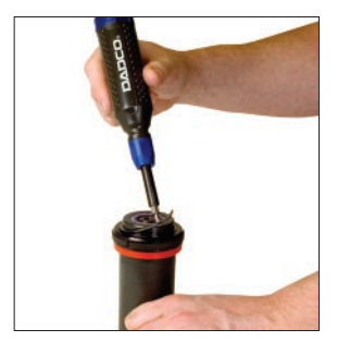
1. Remove the Retaining Ring from the Piston using the Port Servicing Tool's small flat bit.