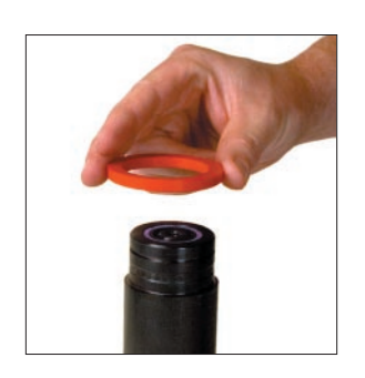
3. Slide the Cushion off the Guide Rod. NOTE: If Cushion shows signs of damage it must be replaced.