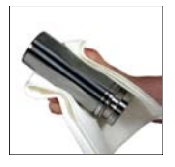
2. Lightly polish the rod surface with an emery cloth (600 grit). Inspect the finish of the rod for any scratches or gouges. If the rod is damaged it must be replaced.