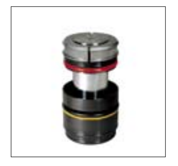
3. Replace the retainer halves behind the collar to complete the rod sub assembly.