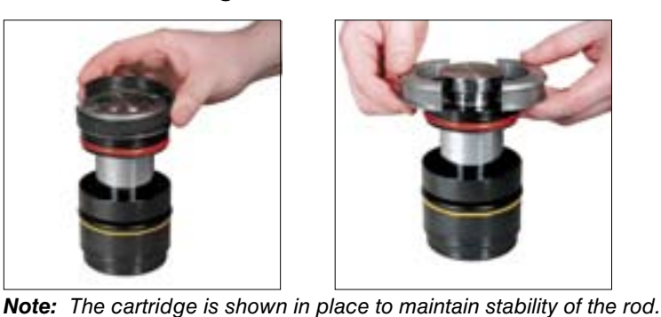
5. Remove two retainer halves.