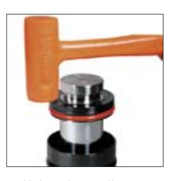
2. Using the mallet or an Arbor Press, seat the collar against the rod safety ring squarely. If retainer won't install, STOP and contact DADCO.