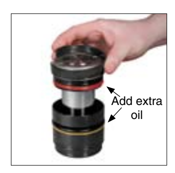
4. Add the wear ring. Extra oil should be applied to the housing o-ring, seal and the inside of the housing.

Return to DADCO's Large Gas Spring Maintenance Bulletin Step VI., Step 3.