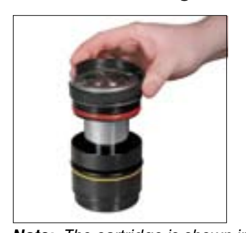
4. Remove wear ring.