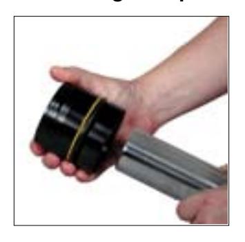
1. Slide the cartridge off the rod and discard.