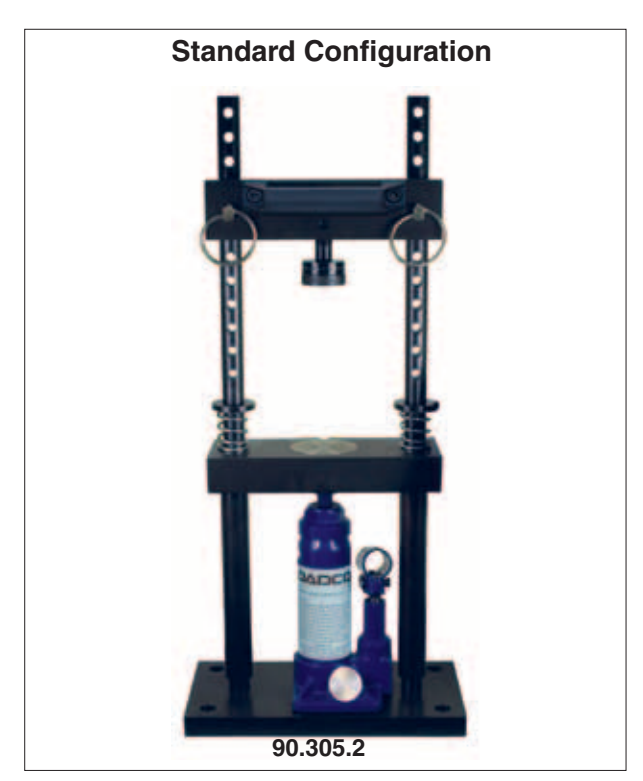
Note: 90.305.2 Mini Test Stand dimenions are H = 742 mm, W = 250 mm, D = 127 mm