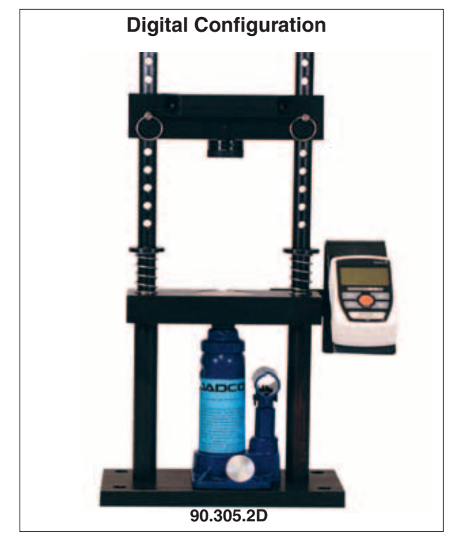
Note: 90.305.2D Mini Test Stand with Digital Load Cell Meter dimenions are H = 742 mm, W = 296 mm, D = 160 mm