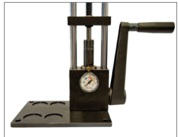
Micro Test Stand shown with Micro 90® in place with 90.300.00090 Load Cell.